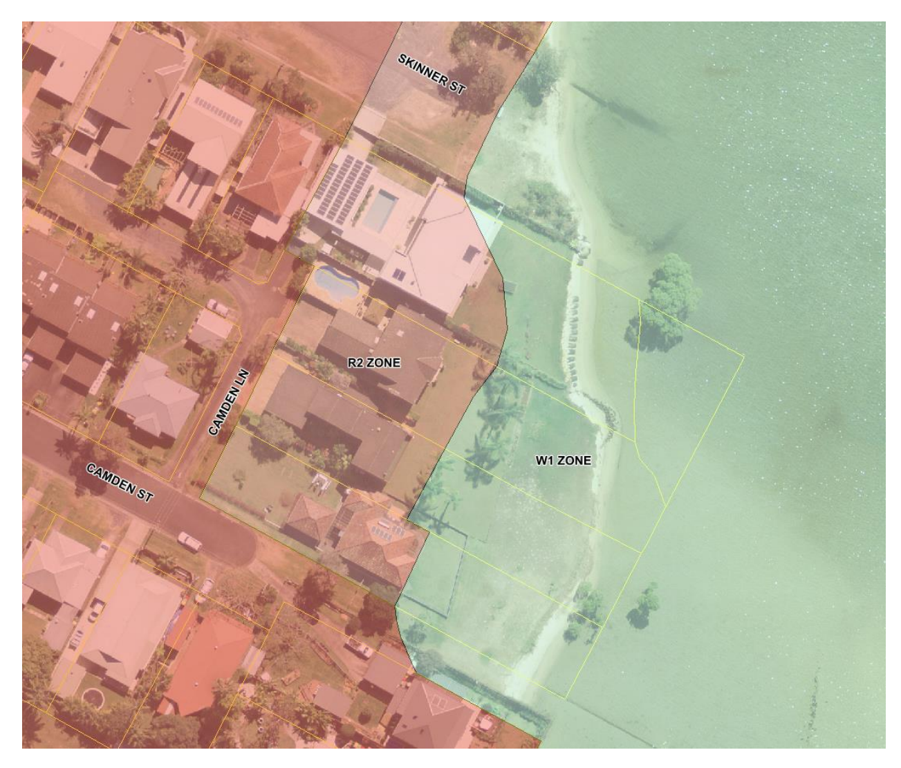
Figure 2. Current Zone Boundary